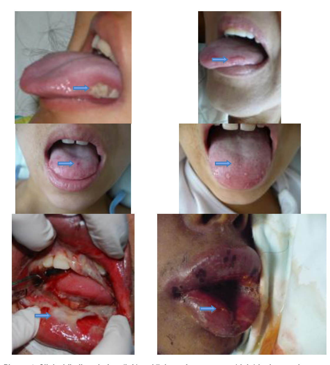
Picture 1. Clinical findings before (left) and 7 days after treatment (right) in three patients

various treatments or established prescription protocols [22]. Evidence exist that the watery extract of Triticum vulgare determines a noticeable acceleration of tissutal repairing processes, stimulates chemotaxis and the fibroblastic maturation and significantly increases the fibroblastic index, which are crucial points in the repairing processes. These activities find an experimental confirmation both in the accelerated protein synthesis and in the enhanced ability of captation and incorporation of marked proline from tissues. Furthermore, the presence of 2-phenoxy ethanol in the gel ensures an efficient antiseptical action. Previous clinical studies