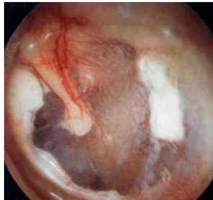
Fig. 1. Left traumatic tympanic membrane perforation

Examination of the ear showed normal appearance of the pinna bilaterally. The left external auditory canal was filled with bloody effluent trickling to the concha. No tragal tenderness was present but there was fullness over the preauricular region. Endoscopic Otoscopy revealed bloody otorrhoea continued, which later turned to clear, colourless fluid with perforated tympanic membrane [Fig. 1]. No clinical signs of facial nerve palsy and no nystagmus. The presence of the CSF in the otorrhoea was ascertained by the presence of 'halo sign' when dropped on a plain white handkerchief and beta-2 transferrin.