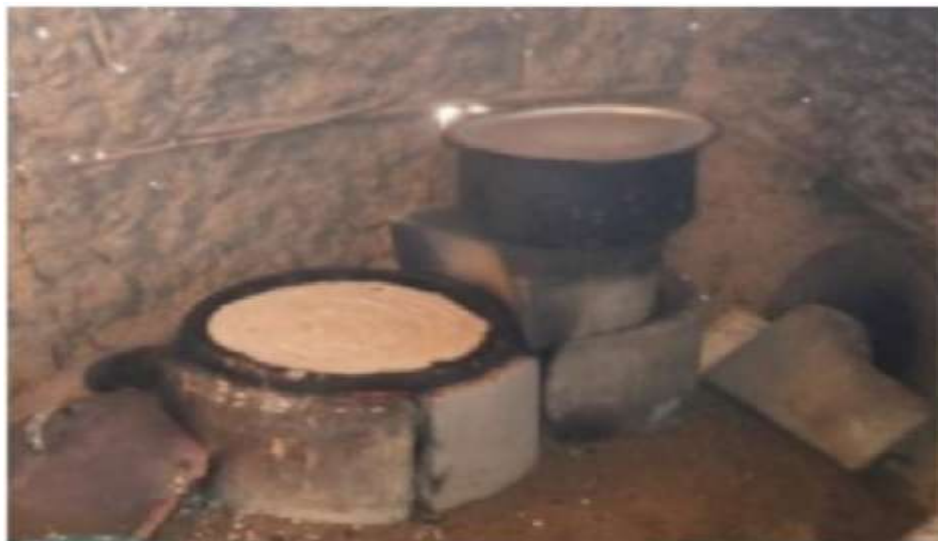
Fig. 2. Harari stove