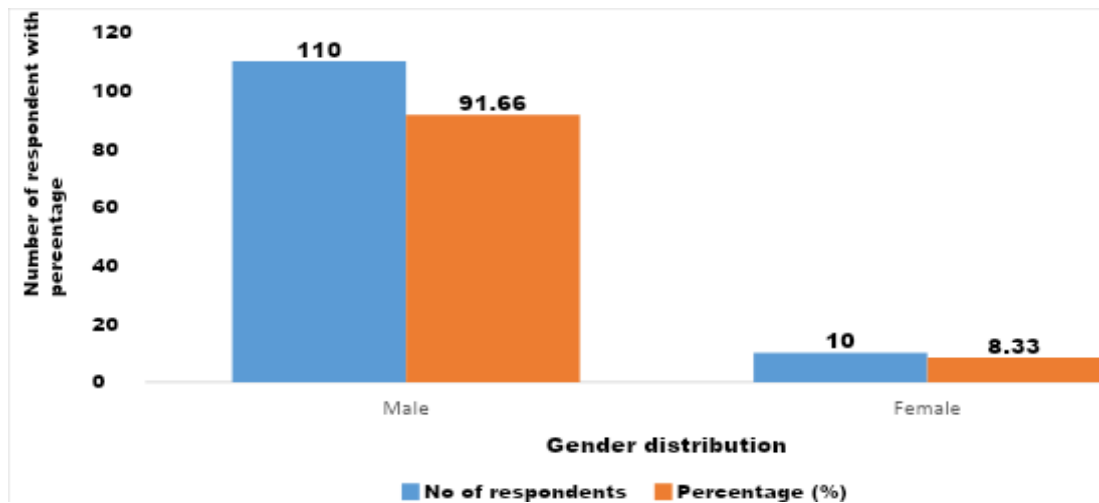
Fig. 2. Gender distribution of head of the family among the respondents