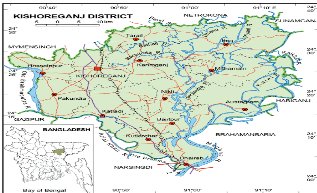
Fig. 1. Map of Kishoregonj District

The research employed a simple random sampling technique to select a representative sample of 120 households from the haor area. The aim was to include residents from various backgrounds whose livelihoods were influenced by the river, without any specific focus on particular groups. The study area mainly focused on Nikli Haor, along with Tarail and Itna upazilas