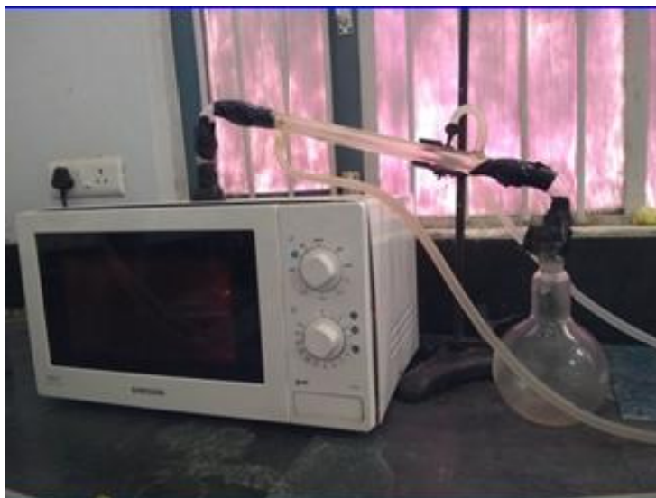
Fig. 1. Microwave assisted essential oil extraction unit