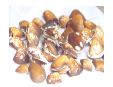
Fig. 2. Egeria radiata (Freshwater clam)