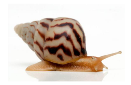
Fig. 1. Limicolaria flammea (Land snail)