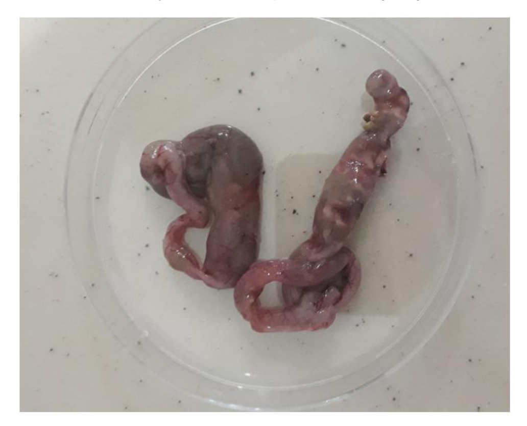
Fig. 1. Showing enlargement of the cecum

In June 2018, a 60-day old American bronze turkey was brought into the laboratory of the Department of Microbiology of the Department of Veterinary Medicine, Van Yüzüncü Yıl University. After the necropsy, the cecum was observed in a swollen state. The typical important lesions associated with histomoniasis are thickened cecal wall filled with dark yellowish fibrinous content (Fig. 1). To confirm the diagnosis smears from cecum stain with Giemsa showing a typical feature known as the flagellated form of the parasite as showing in Fig. 2.