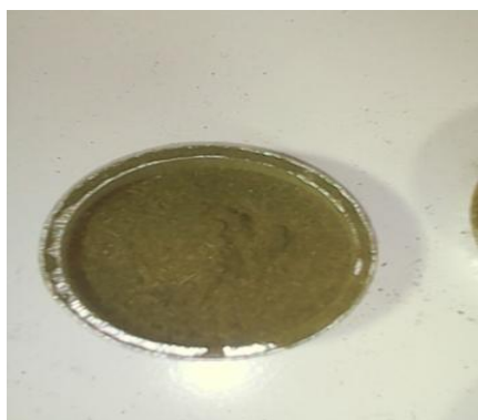
Fig. 2a. M. oleifera powder leaves unfermented

The fermentation of M. oleifera powder leaves is possible to increase the protein product due to increase of biomass; increasing the reducing sugar content due to the hydrolysis of complex sugars and phenolic compounds. Indeed phenolic compounds are abundant in the young stages of development of plants [16]; they reduce the onset of maturation and then become stable [17].