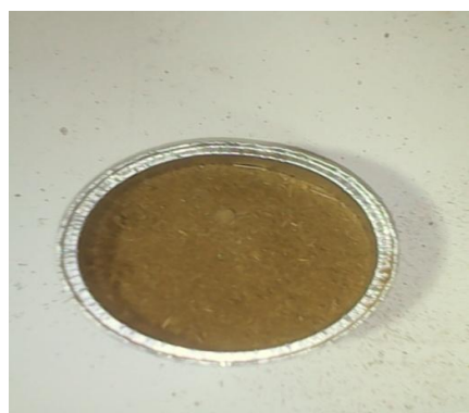
Fig. 2b. M. oleifera powder leaves fermented