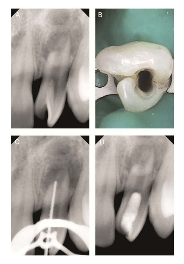
Fig. 2A. Preoperative radiograph of tooth#10 Fig. 2B. Access cavity preparation Fig. 2C. Working length radiograph of tooth #10 Fig. 2D. Radiograph after PRP insertion and MTA placement

by venipuncture of the antecubital vein of the patient's right arm. Blood was collected in a 15ml sterile glass tube coated with an anticoagulant (acid-citratedextrose. Health Line Pharmaceuticals Pvt. Ltd., India). Whole blood was initially centrifuged at 2,400 rpm for 10 minutes in a centrifuge (H.L. Scientific Industries, India) to separate PRP and platelet-poor plasma (PPP) portions from the red blood cell fraction. PRP and PPP portions were again centrifuged in a centrifuge (H.L. Scientific Industries, India) at 3,600 rpm for 15 minutes to separate the PRP from the PPP. PRP was then injected into the canal space up to the level of the cementoenamel junction (CEJ). Three millimeters of white MTA (Pro-Root MTA; Dentsply Tulsa Dental Specialties, Tulsa, OK, USA) was placed directly over the PRP clot. A moist cotton pellet was placed over the MTA and provisionally restored with Cavit (3M ESPE AG, Seefeld, Germany).