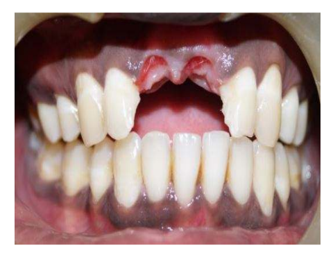
Fig. 4. Complete healing of soft tissue in 11, 21 region preserving the interimplant papilla