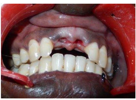
Fig. 1. Pre-operative 11, 21 avulsed site

A complete blood examination was done, and CBCT was taken to evaluate the alveolar bone topography. The blood parameters fell within normal limits and the alveolar socket was intact in relation to both the avulsed teeth corresponding to 11 and 12. Patient was prescribed with prophylactic antibiotic of Amoxycillin 500 mg and Piroxicam derivative 20 mg prior to the surgery. Immediate implant surgery was planned within 48 hours of tooth-avulsion.