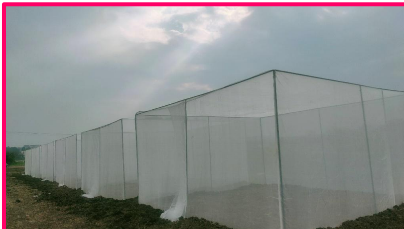
Fig. 1. Screen houses for screening of genotypes

Maize genotypes were rated for FAW resistance. Resistance was assessed based on FAW damage scores obtained after the infestation. FAW leaf-damage (LIR) rating was recorded after 7 days, 14 days, 21 days, 28 days and ear damage at harvest (Fig. 5, Fig. 6), for Leaf Injury Rating (LIR) and ear damage 1 to 9 scale was adapted from Modified Davis and Williams, 1992 where a score of 1 denotes a healthy plant with no damage symptoms and a score 9 denoting a completely damaged plant with no possibility of recovery (Table 2, Table 3).