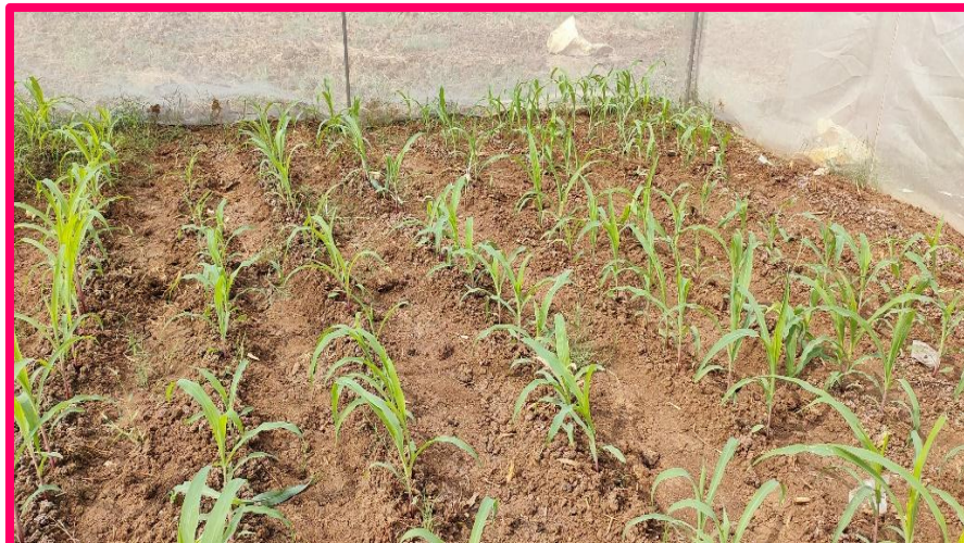
Fig. 3. V5 stage of maize genotypes