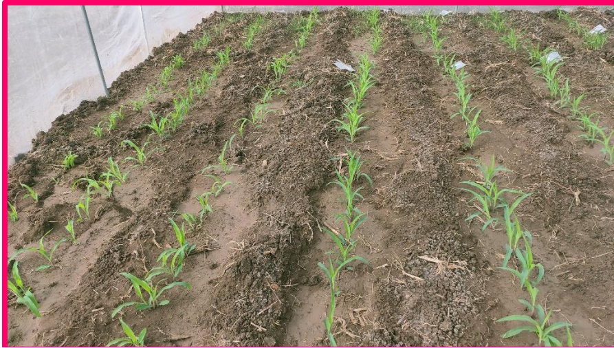
Fig. 2. Genotypes in screen house