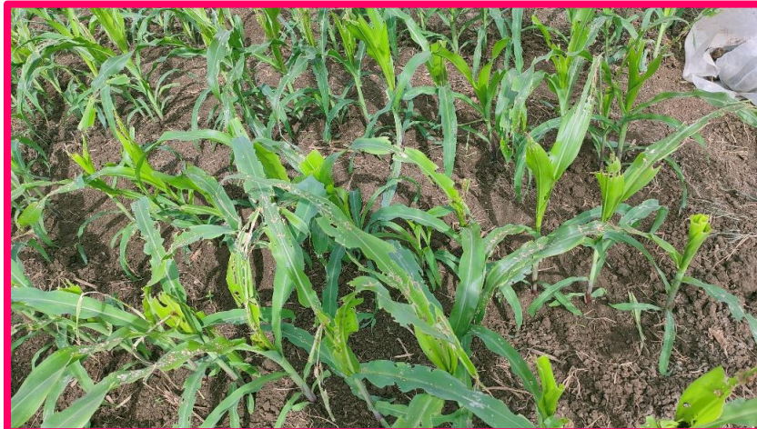
Fig. 5. Leaf Injury Rating (LIR) at V7 stage