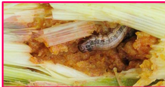
Fig. 6. Ear damage