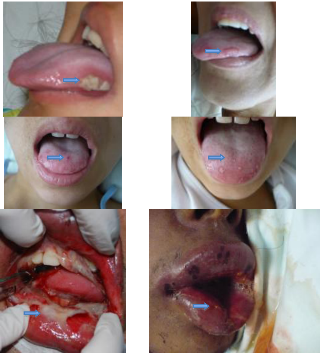
Picture 1. Clinical findings before (left) and 7 days after treatment (right) in three patients

various treatments or established prescription protocols [22]. Evidence exist that the watery extract of Triticum vulgare determines a noticeable acceleration of tissutal repairing processes, stimulates chemotaxis and the fibroblastic maturation and significantly increases the fibroblastic index, which are crucial points in the repairing processes. These activities find an experimental confirmation both in the accelerated protein synthesis and in the enhanced ability of captation and incorporation of marked proline from tissues. Furthermore, the presence of 2-phenoxy ethanol in the gel ensures an efficient antiseptical action. Previous clinical studies