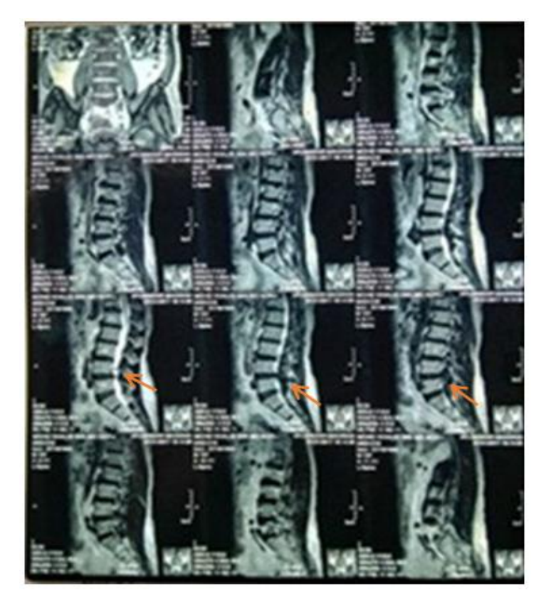
Fig. 1. Preoperative T2 weighted MRI showing L4 intracanal synovial cyst with L1/2 to L4/5 posterior disc bulge with L3/4 & L4/5 bilateral exit foramina stenosis and L4/5 spinal canal stenosis

Radiographs of the lumbo-sacral spine show erosion of the sacrum but this feature is common to most space-occupying lesions in this area (Camp and Good 1938). MRI appears useful as an initial modality to identify the cystic mass. Myelography and/or CT myelography are essential to reveal any connection between the cyst and the subarachnoid space [12]. The presence of contrast medium within a sac, in conjunction with erosion of bone or widening of the vertebral canal, is strong evidence in favour of an extradural cvst [1]. The definitive treatment available is posterior laminectomy as it giving a good exposure. Although numerous surgical treatment methods have been proposed, the results of surgery were variable [5]. The operative treatment most commonly advocated has been total excision of the cyst [6].