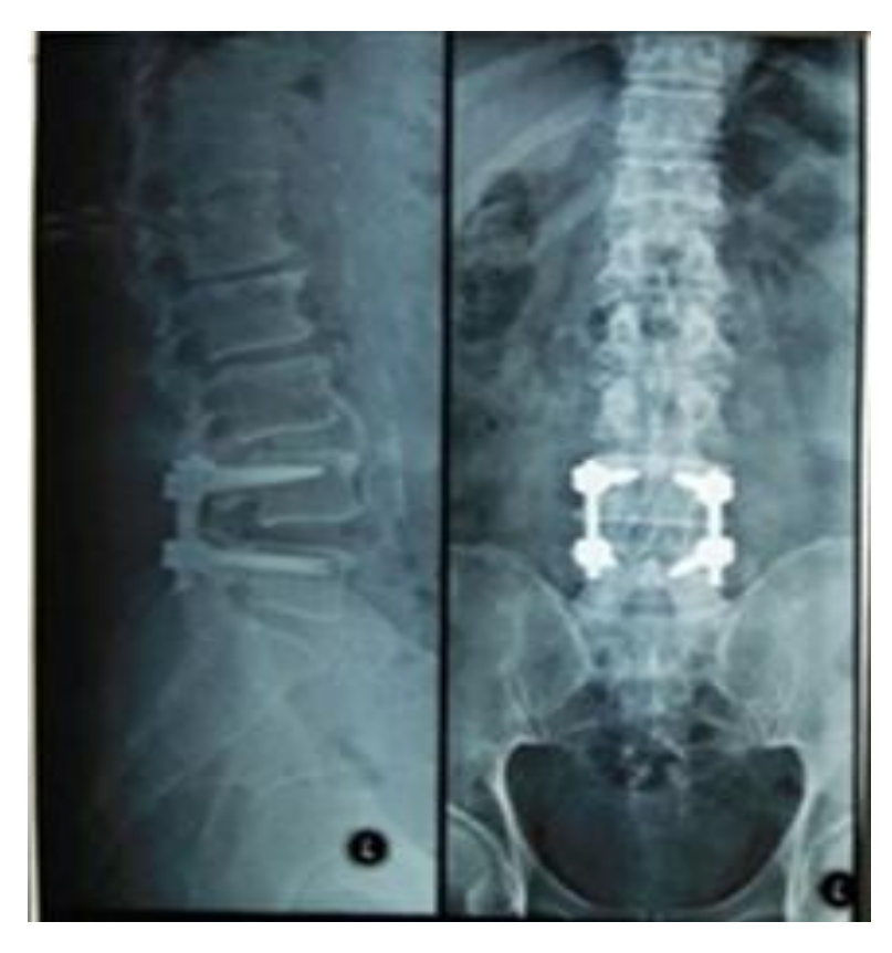
Fig. 3. Post-operative x-ray showing decompression and posterior instrumentation of L4/5 was done