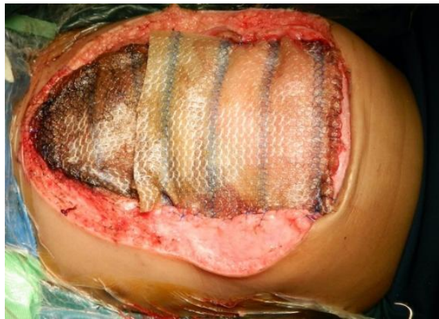
Fig. 5. The picture shown a surgical mesh to close the thoracic and abdominal cavity in Baby B