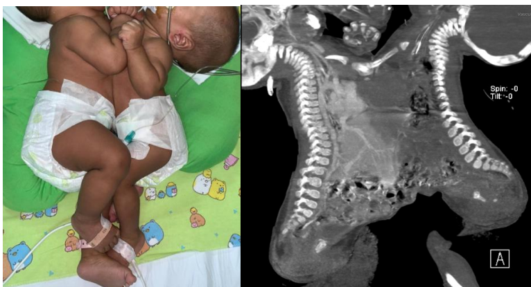
Fig. 1. Two babies shown thoraco-omphalopagus twins, conjoined from the sternum with a surface area of 15 x 9 cm

graft (STSG) in the donor area within three months. After the surgery, both babies showed improvement in their respiratory functions, which were marked by their successful weaning from the ventilator in 1 month in Baby A and two months in Baby B. Baby A was discharged two months after surgery, and Baby B was discharged three months after surgery.