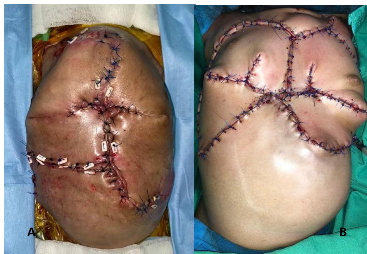
Fig. 5. Defect at the anterior thorax and abdomen was closed using keystone flap by plastic surgeon in Baby A and Baby B