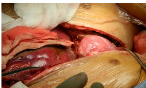
Fig. 2. Separation of pericardium of two babies, an incision was made in the lateral chest wall. After pericardium was safely separated, the diaphragm was released