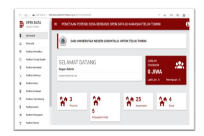
Fig. 1. Use of case diagram application

Mulyanto et al.; Adv. Res., vol. 24, no. 6, pp. 84-95, 2023; Article no.AIR.106618