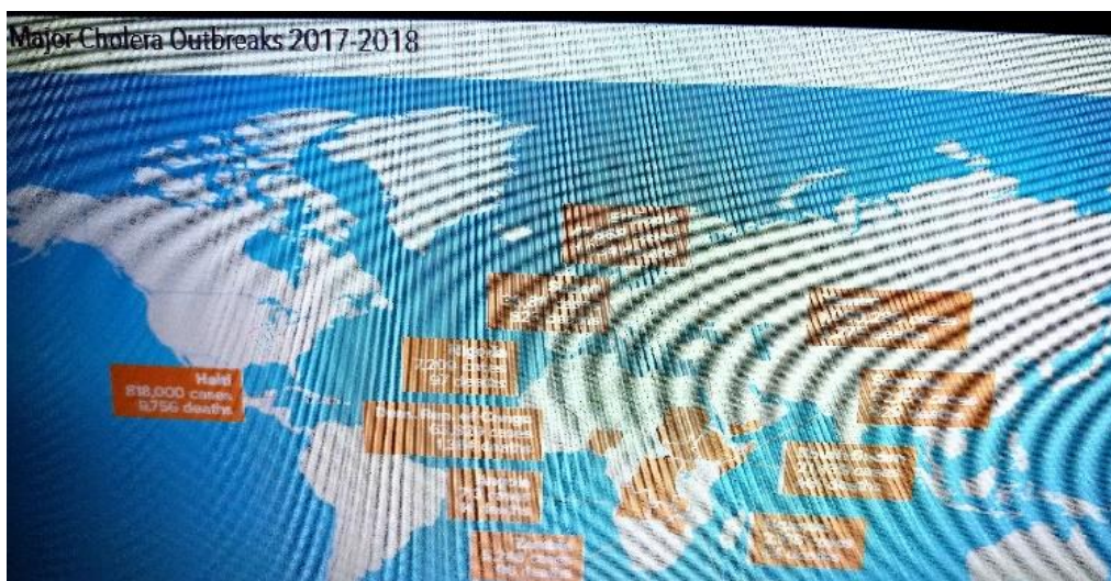
Fig. 1. Map showing different countries affected by major cholera outbreaks in 2017-2018 study location.

Source: WHO, Weekly Epidemiological Bulletins [49]