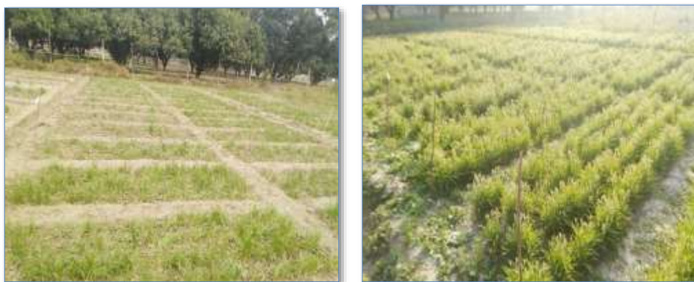
Fig. 1. Screening of Isabgol genotypes against downy mildew disease

moderately resistance against downy mildew viz; IM-7, IM-12, IM-13, IM-14, IM-16, IM-17, IM-18, IM-21, IM-22, IM-23, IM-25, IM-26, IM-31, IM-33 and IM-35, 8 genotypes were found moderately susceptible against downy mildew i.e., IM-1, IM-8, IM-9, IM-15, IM-20, IM-24, IM-27 and IM-34, 5 genotypes were found susceptible against downy mildew i.e., IM-5, IM-6, IM-10, IM-11 and IM-19. The maximum yield/plot was recorded in IM-2 (580 gm), IM-17(580 gm) and IM-30 (580 gm) followed by IM-14 (510 gm) and IM-28 (510 gm). Whereas minimum yield/plot was found in IM-5 (80 gm) and IM-19 (80 gm) followed by IM-7 (130 gm) and IM-21 (130 gm). Islam [11] evaluated eight genotypes of Isabgol and found highest plant height (42.33 cm), number of tillers per plant (7.33), no of leaves per plant (74), length of spikes (4.03cm, seed weight (2.0g) and seed yield (823kg/ha) in PO-001 and lowest in PO-007. The maximum disease intensity (62.77%) was observed in the crop which was sown on 12 th November and least disease intensity was recorded in 28 th November [12].