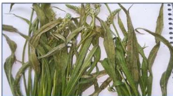
Fig. 2. Downy mildew infected leaves of Isabgol