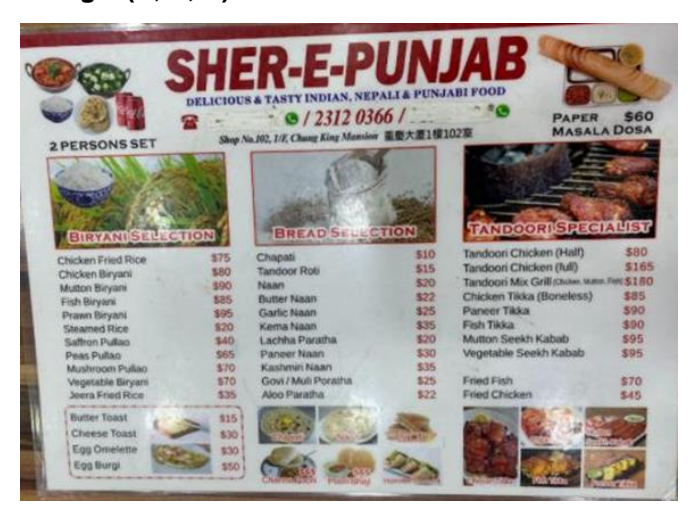
Fig. 5. Menu in pure English