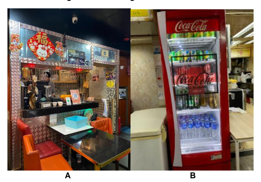
Fig. 7(A, B) Inner settings in the restaurants