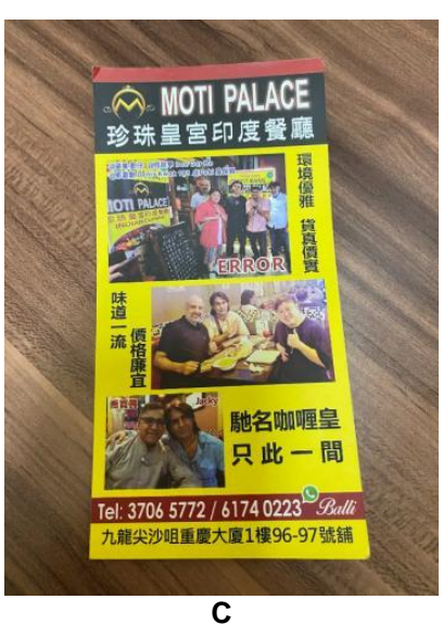
Fig. 1(A, B, C). Restaurant promotional pamphlets