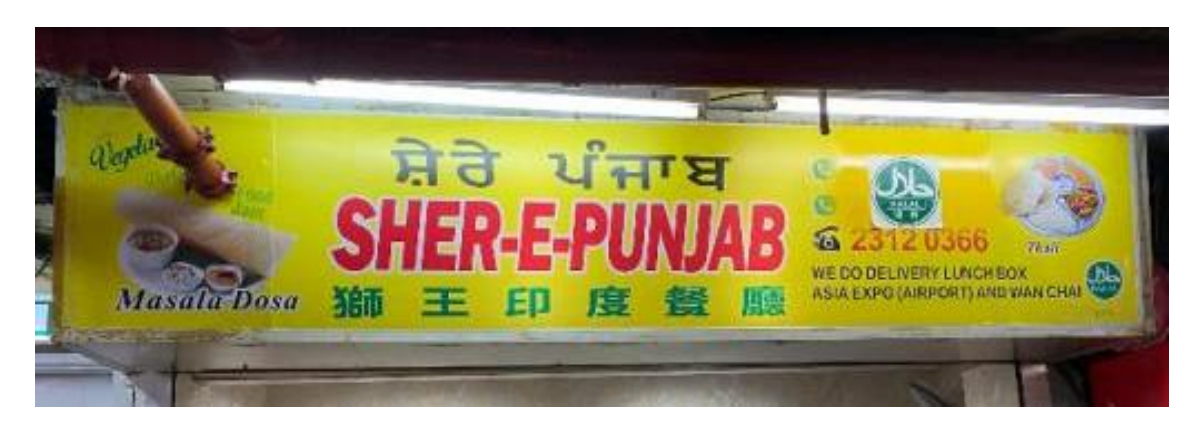
Fig. 3. Restaurant banner

The restaurants usually do not include lots of Indian features in the inner settings. Owners try to avoid local visitors stereotyping the restaurant as Indian-specific. They may feel distanced from the unfamiliar culture and lower the likelihood of visiting. Instead, the inner design reflects the combination of various cultures. For example, the decorative banner 'Happy Birthday' (Fig. 6), uses the tips box as a traditional British culture and the wine glass rack (Fig. 7) as Western-liked. In addition, several shops use the 'Cola fridge' which is a signature item for much cha chaan teng (i.e., local restaurants in Hong Kong) and 'Fai Chun' (i.e., decorative banner to be hung up during Chinese New Year that means good luck) (Figs. 7A and 7B). They also use the 'Slippery Floor' and 'No Liquor under 18'signs in Chinese. As shown in the cashier, they accept different payments e.g., credit cards and WeChat Pay (i.e., a common payment method in China). Yet, they retain some Indian features, for instance, the lotus statue and incense burner. Indians treat lotus as a symbol of dignity and sanctity, which auspiciousness. represents peace enlightenment while the incense burner relates to religious faith.