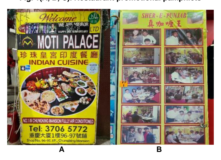
Fig. 2(A, B). Restaurant Promotional Posters