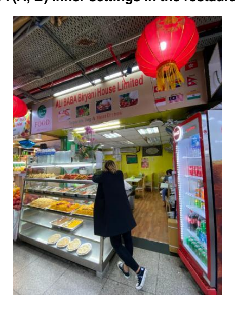
Fig. 8. Fast food shops