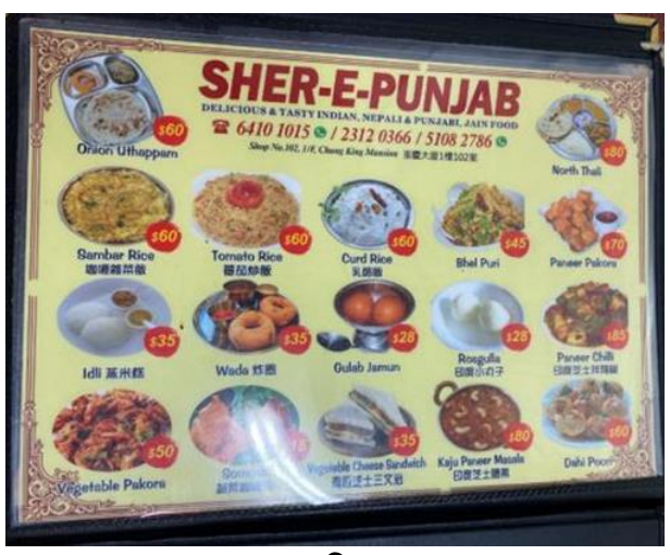
Fig. 4(A, B, C). Menus with chinese translation