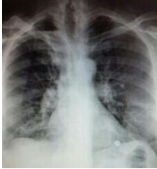
Fig. 4. Control chest radiography