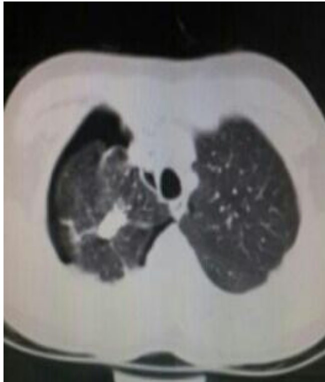
Fig. 2. Preoperative tomography image