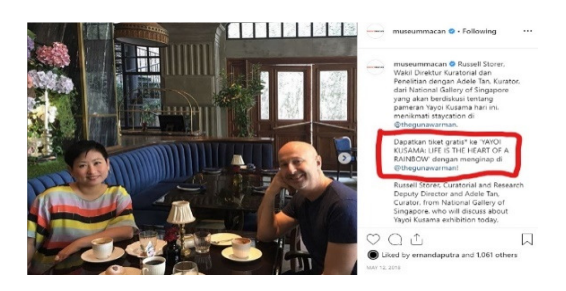
Fig. 4. Night-spending package can get free entrance ticket to Museum Macan