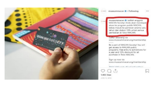
Fig. 3. Membership Package Program