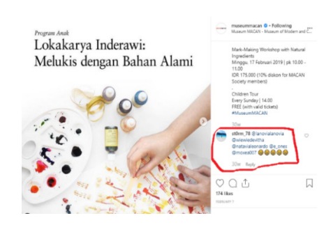
Fig. 2. E-Word of Mouth by tagging their friends' accounts