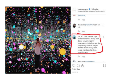
Fig. 1. Comments' on follower's feeds of Museum Macan

The last component of tourism destination is available packages in which the management party informs it through its Instagram account that there is a membership program where the visitor that becomes the member can enter the public space freely for one year. Besides, every goods purchasing in Museum Macan Souvenir Shop will get discount from 5 to 10%. In addition, the other package is the visitor who spends night at The Gunawarman Hotel will get free entrance to Museum Macan .