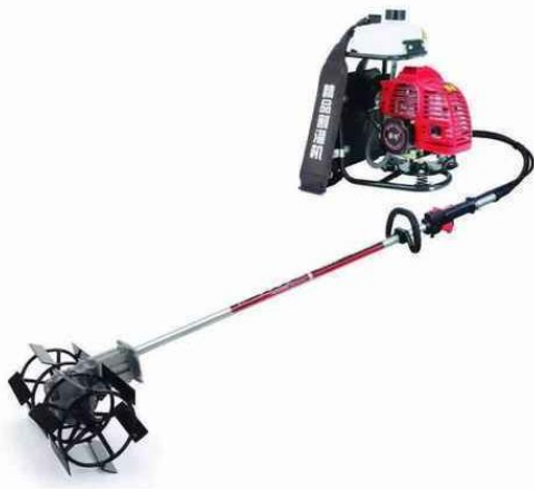
Fig. 1. Back pack weeder