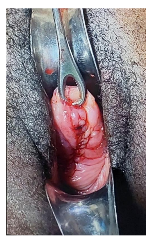
Fig. 5. Appearance of the cervix immediately after successful cervical perforation repair was done