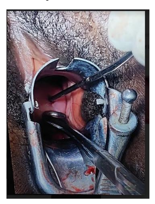
Fig. 1. Speculum examination showing the position of the cervix Os

presentation and it was through medical means. At presentation she was lethargic, pale, anxious, dehydrated, afebrile, with temperature of 36.8 degree centigrade and nil pedal edema. Her pulse rate was 120 beats per minutes small volume, blood pressure was 90/60mmhg. Respiratory rate was 26 cycle per minutes. Abdomen was full moves with respiration, there was suprapubic tenderness, no guarding, no rebound tenderness and bowel sound was normoactive. Pelvic examination revealed vulva that was smeared with fresh blood and vagina canal packed with gauze. Speculum examination revealed a closed cervical Os, with a punctured injury on the posterior wall of the cervical body at around 6 o' clock position, measured about 3 cm x 3cm communicating with the uterine canal. [Figs. 1, 2, 3] There was product of conception protruding through the punctured wound. A sponge holding was used to remove the product of conception plugging the punctured false tract and the bleeding abated afterwards.