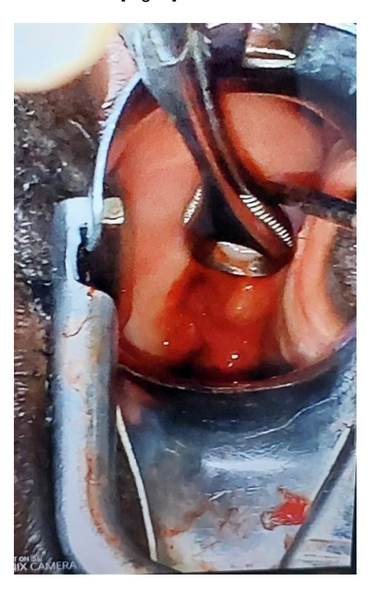
Fig. 2. Speculum examination showing bleeding from the cervical injury

abdomino-pelvic ultrasound scan revealed a bulky uterus measuring 6cm by 8cm with a thickened and irregular endometrial lining but no product of conception was noted. The internal Os is about 8mm opened. The adnexa are bilaterally free and there was no fluid collection in the pouch of Douglas. The bowel echoes were normal with adequate peristalsis. No bowel wall thickening, the stomach contained some fluid content, no gaseous accumulation. Other abdominal organs were sonographically normal. There was no evidence of fluid in the peritoneal cavity. Chest x ray was done and there was no air under the diaphragm, erect abdominal x ray was also normal [Fig. 4].