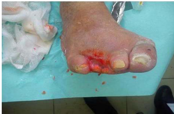
Fig. 2. Diabetic foot ulcer after ten months of treatment with the isopod extract and eosin