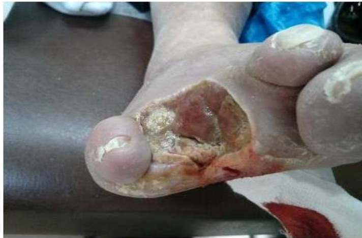
Fig. 1. Diabetic foot ulcer at baseline

DFU by photodocumentation (camera Sony Cyber-shot H300) measuring its dimensions using the image-analysis program AutoCAD (Autodesk Inc., San Rafael, California, U.S), at each monthly visit [10]. Tewameter TM 210 is a device which evaluates the skin water barrier function by measuring the humidity rate on the skin surface in g/h/m^2 [11]. Furthermore, Corneometer CM 820 is a device that is used to accurately determine the level of hydration of the skin surface by measuring the electrical capacitance in arbitrary units [11]. During treatment the TEWL was reduced but the level of hydration was gradually increased in the skin of the FU (Fig. 4). The evolution of the wound area during the topical treatment is presented in Fig. 3. It is worth noting that the patient did not quit smoking and her BMI did not change during therapy.