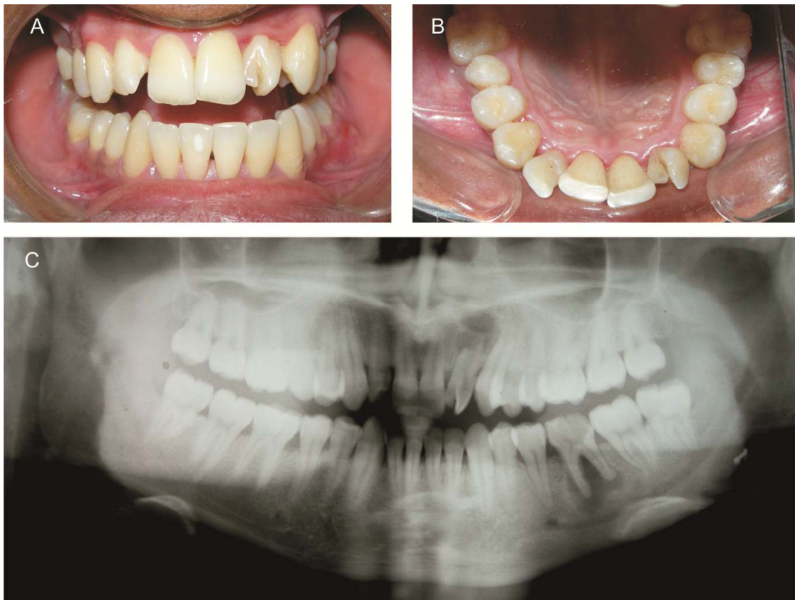
Fig. 1A and 1B. Preoperative photographs depicting unusual morphology of tooth #10 Fig. 1C. Orthopantomogram of the patient

Considering various treatment options for tooth #10, a decision to perform a regenerative endodontic procedure with the aid of PRP was made. The patient was informed that this treatment was an attempt to initiate further root development and that the proposed treatment may not have a successful outcome. A written informed consent was obtained from the patient.